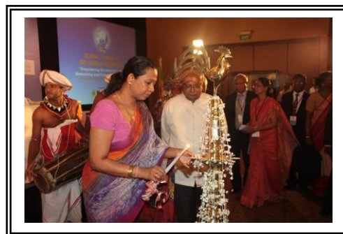
Lighting of the traditional oil lamp