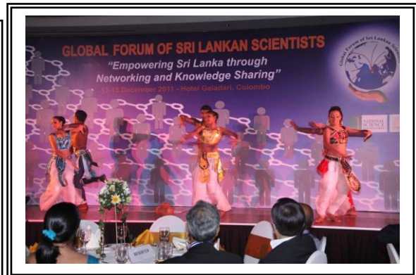
Cultural event - performance by ‘Sri Lanka Youth’ - sponsored by Sri Lanka Convention Bureau