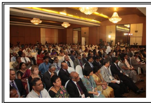
Over 325 participants attended the inauguration ceremony

The inauguration was followed by three days of plenary, key note addresses and breakout/panel discussion sessions. Between 200 to 250 participants were registered for the plenary and breakout/panel discussion sessions on each of the three days of the Forum.