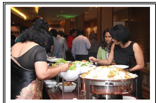
Participants at the Conference Banquet