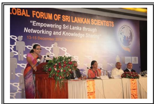
Hon. Pavithra Wanniarachchi, Minister of Technology and Research addressing the gathering

The expatriate and foreign scientists who attended the Forum were from United Kingdom, United States of America, Australia, New Zealand, Ireland, Japan, Hong Kong, Singapore, India, Taiwan, Korea, Norway and France.